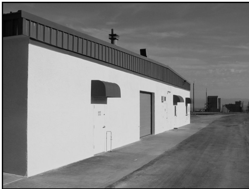
Figure 2. Front laboratory limewash, not pigmented.

The initial coat on both materials was absorbed well and the stucco turned out to be quite easy to work with. All told, 5 coats of un-pigmented limewash, followed by two coats of pigmented limewash, covered that portion of the stucco wall that the owner wanted colored. For the front of the building, the owner decided that the limewash should be left unpigmented and a full 7 coats covered that section. The result was a very impressive consolidation of the surface cracks and filling of the larger, ¼" cracks. The concrete was more difficult because of uneven absorption, but by sticking at it, 13 coats finished the job. The concrete was pigmented as well, but never reached the same level of solid coverage as did the stucco. In all, the job required over 250 gallons of limewash. The tall areas of the building were worked from scaffolding, which allowed a more efficient application of material by avoiding many repeated trips up and down ladders. The entire job took one month to complete from start to finish, including cleaning, repair, experimentation and limewashing. The ragged, stained, and dirty building has been refreshed. (Figure 2)